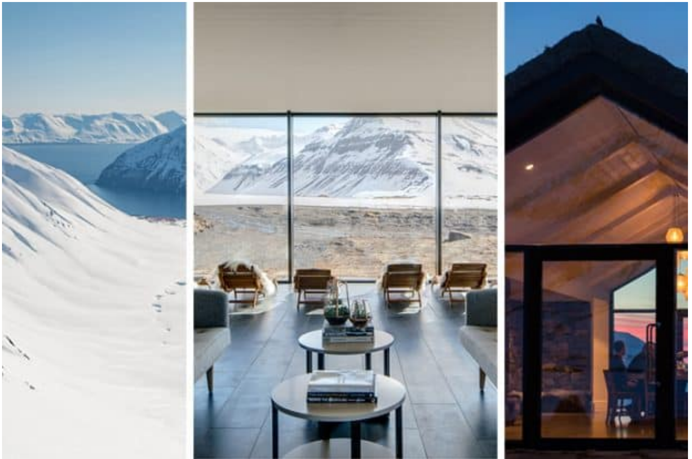
From left: heli-skiing, the spa and the dining room at Deplar Farm

It's nearly midnight on my second day at Iceland's Deplar Farm as the Northern Lights reach their strongest fluorescence of the evening. Reclining on a built-in lounge chair in the resort's geothermally heated pool, I observe the phenomenon, which has been dancing across the sky in shades of green and the occasional violet, caused by colliding atomic oxygen and molecular nitrogen particles, respectively, for an hour. Buoyed by the endorphins still rearing from a day spent heli-skiing and fly-fishing, the other pool party attendees and I sip beverages from the swim-up bar, plunge into the water, where the evening's Bob Marley soundtrack plays even louder, and float with our eyes pressed upwards.