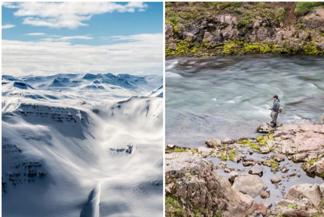
From left: the mountains surrounding Deplar Farm; fly-fishing in the summer

And while it is without a doubt the most pampering property in Iceland, Deplar is, at its core, about exploring the outdoors. Eleven Experience has hand-picked some of the best wilderness guides in the world, who skillfully lead intermediate skiers down runs commensurate with their ability, demonstrate the proper technique for skeet shooting, and who also entertain, in the evenings, with a heavy dose of wit.