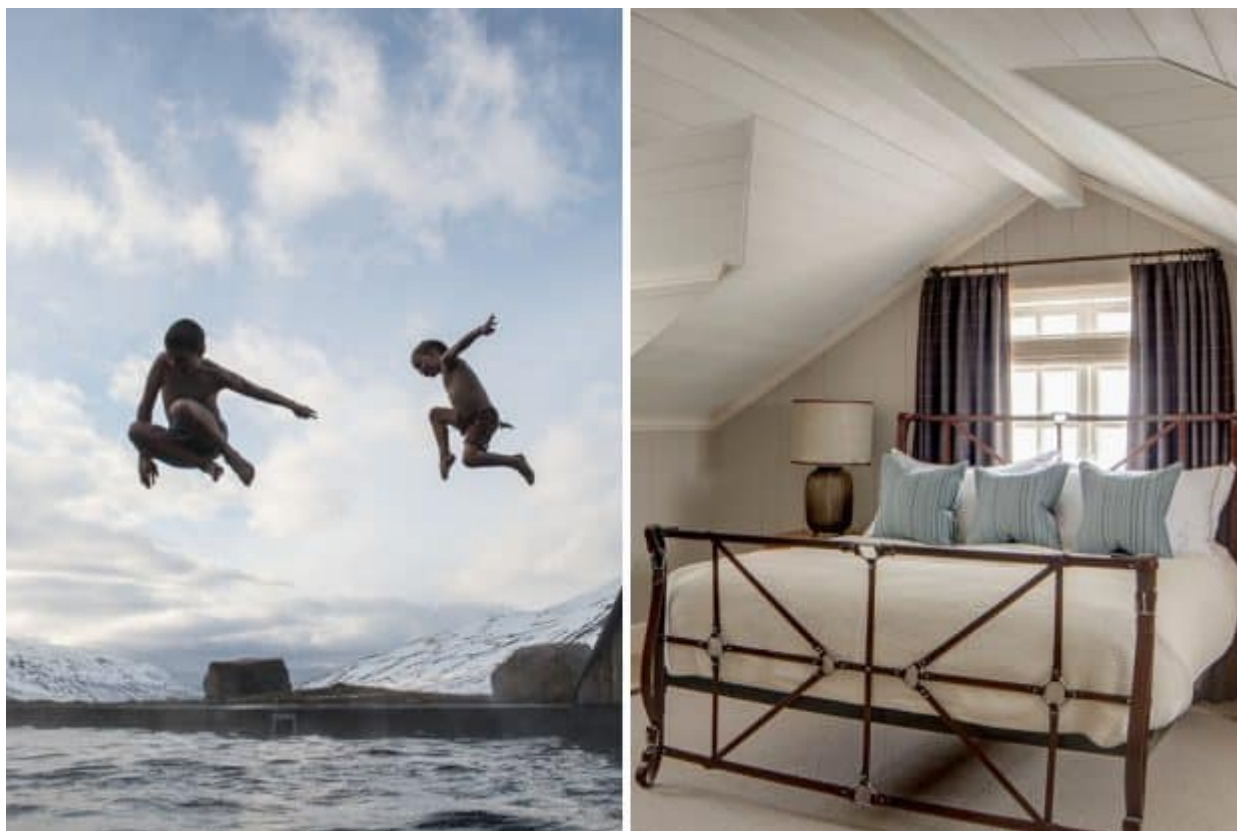
From left: kids jumping into the pool at Deplar Farm; a room

Located on a former sheep farm in a Narnia-like wonderland on northern Iceland's Troll Peninsula, Deplar Farm opened in the spring of 2016. The 13-room property blends into the dramatic mountainous landscape with a grass roof and enough glass walls that it is camouflaged almost entirely when viewed from the right angle. On the inside, the property is designed to perfection thanks to Pike's wife, who runs No. 12 Interiors and styles each of the group's properties as though it were her own home. The dining room wall is decorated with a rare collection of taxidermied Icelandic birds, the bar is made with reclaimed Siberian driftwood that the staff scavenged at a nearby beach, and the plush rooms, all designed in soft earth tones, tout complimentary mini bars with craft chocolates and local beers, Mr. Steam showers and Aesop bath products.