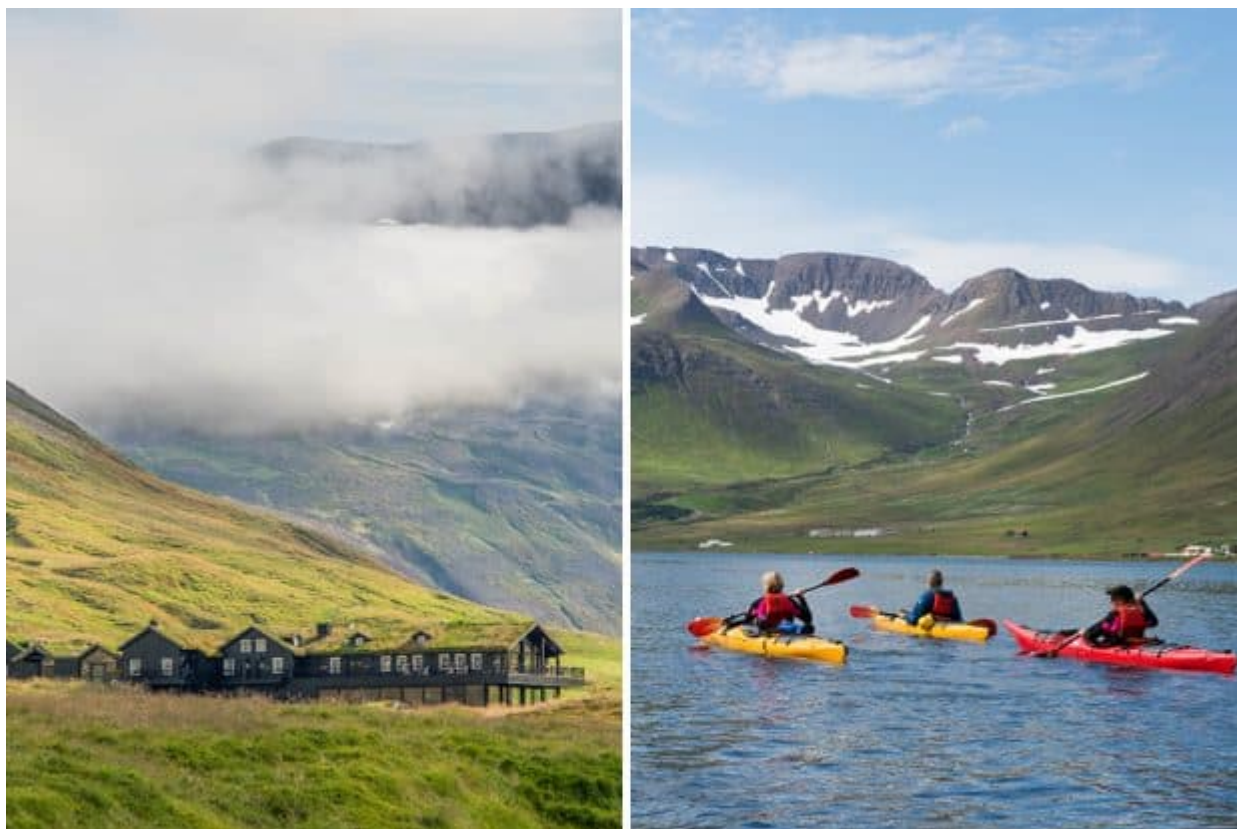
From left: Deplar Farm in summer, sea-kayaking

Open year-round, Deplar offers many seasonal farm-based activities. Laser tag in the surrounding countryside, fat-tire biking and snowmobiling can be arranged upon request, as can day trips to the fjords for whale-watching, surfing and sea-kayaking. Leisurely pursuits also abound, beginning in the spa, which features an indoor/outdoor pool complete with a swim-up bar, hot and cold plunge pools, a steam room and treatment rooms, as well as two i-sopod float tanks. These sensory deprivation tanks are filled with skin temperature salt water, encouraging the user to float and fall asleep or into a meditative state. A haven for kids at the property, the media room comes stocked with Nintendo, PlayStation and a full snack supply. The gym is well equipped; a yoga studio looks over at the beautiful countryside; and the upstairs bar area boasts a foosball table, darts board, pool table and Ping Pong set. Deplar is designed so that kids, as well as young-at-heart adults, can game in style.