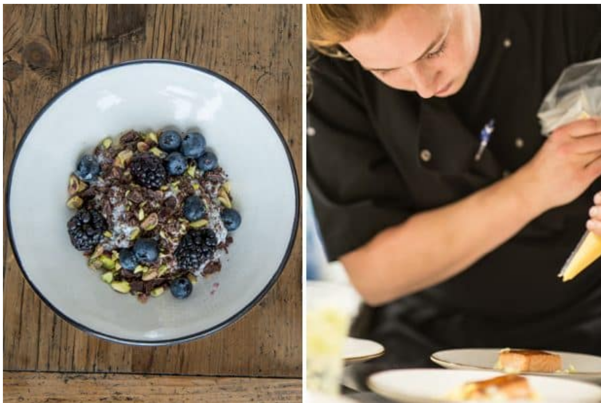
From left: chia seed pudding with chocolate and berries; the chef at work

The last piece to any successful hotel puzzle is the culinary program, and the one at Deplar excels on all fronts. Breakfast begins with your choice of hot items (think Icelandic pancakes and huevos rancheros), supplemented by the buffet bar, which offers such healthy fare as overnight oats with blueberries and chocolate shavings, skyr (Icelandic yogurt) and granola and a savory spread of smoked salmon and charcuterie. Lunch is enjoyed either in the field (skiers eat mid-mountain but Ghost House will open later this year and offer après dining on the slopes) or at the resort. A typical field lunch might include grilled steak with Israeli couscous and roasted carrots and dates and chocolate-almond clusters for dessert. Guests and guides usually have dinner together in the main dining room, which boasts stunning sunset views of the striking landscape, but private dining can be arranged anywhere on property. Dinner tends to be more upscale, with two courses and dessert, but guests can request simple fare or Italian pies from the pizza oven.