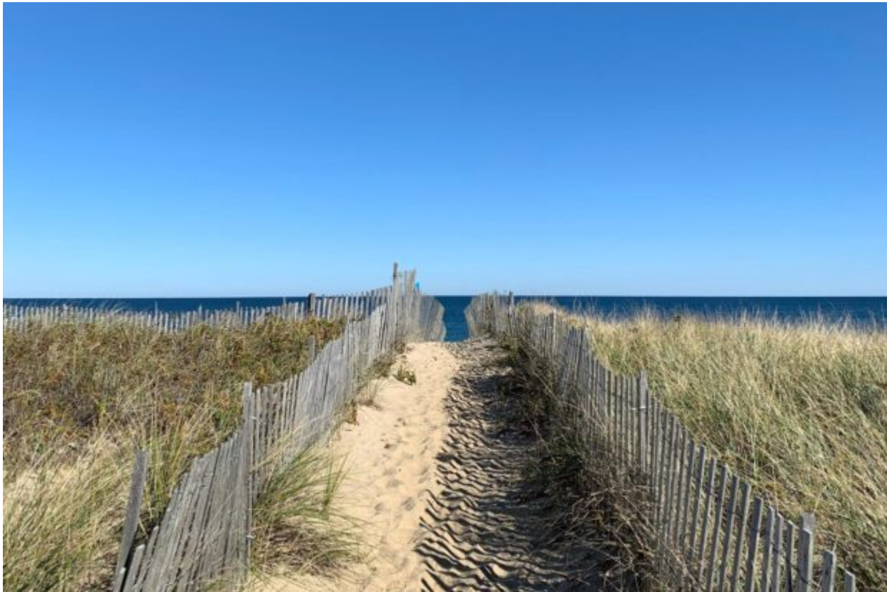
Nantucket in October.

If Miami in the late fall attracts the see-and-be-seen crowd, Cape Cod, Martha's Vineyard and Nantucket and the coast of Rhode Island draw travelers seeking peace and quiet. Temperatures hover in the 60s through November, so there is plenty of opportunity for beach time—albeit lengthy strolls instead of hours in a cabana. This corner of New England is the ideal destination to combine action (biking, hiking, and sailing are brisk and beautiful this time of year) with laid back inaction. Make the most of good weather days outside, but save some time for browsing local boutiques in historic port towns and touring 18th- and 19th-century homes-turned-museums. Our favorite hotels in the area, including Cape Cod's Chatham Bars Inn , Nantucket's White Elephant and Rhode Island's Ocean House and Weekapaug Inn also warrant at least a few hours of lounging on-property, be it in a lawn chair or by the fireplace.