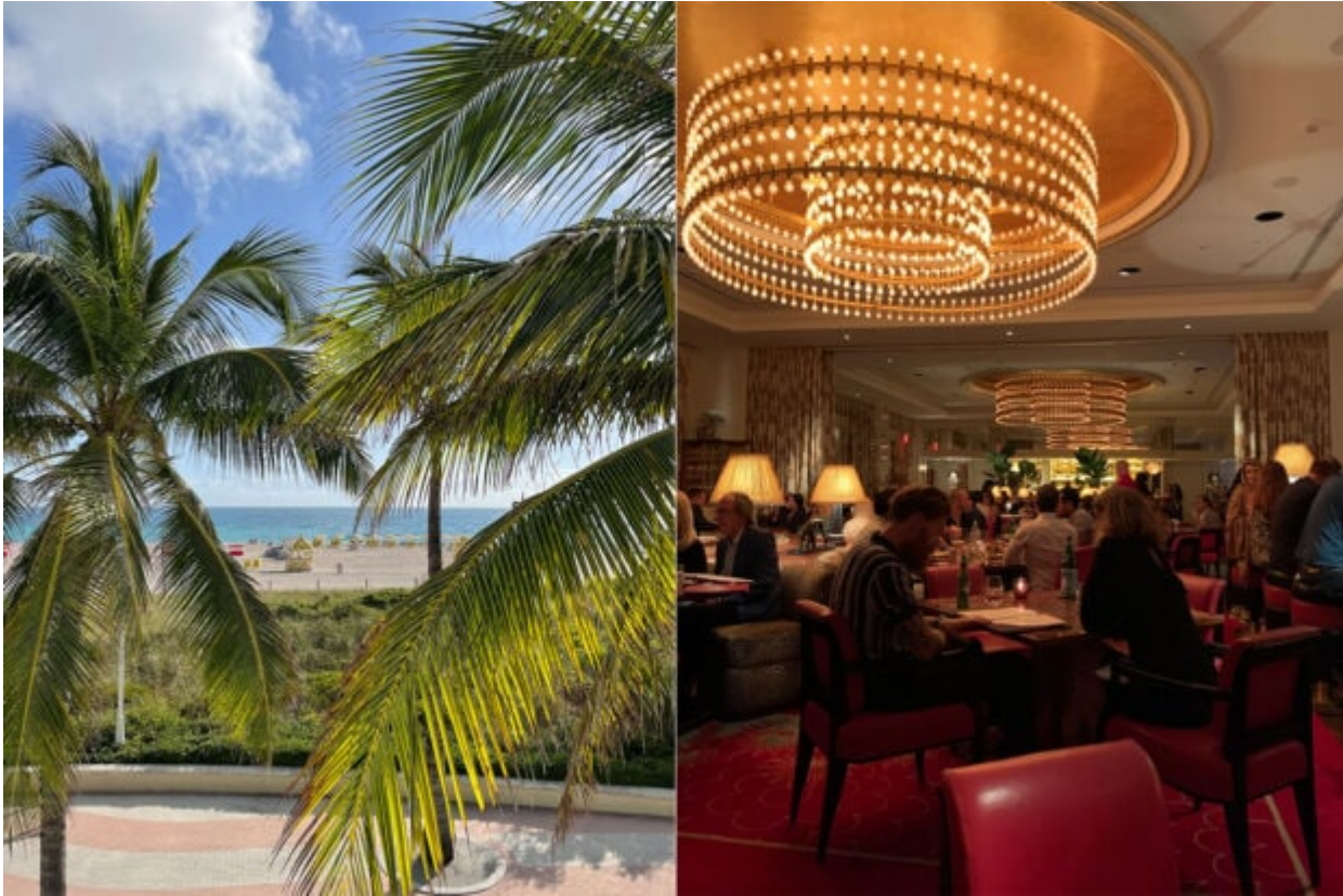
Miami Beach (left) and Los Fuegos.

With its avant-garde art and design districts, fusion culinary scene and seven-square-mile stretch of white-sand beach, Miami lures sun worshippers and culture hounds. And with the worst of hurricane season behind, Southern Florida in the fall promises near-perfect weather for lounging poolside and dining al fresco. The It crowd can be seen at buzzy new restaurants, as well as more established spots such as South Beach's Stubborn Seed , for tasting menus, and Zuma , for Izakaya-style Japanese cuisine in Brickell. Mid-Beach has some of the best resorts, including Faena —with its splashy and splurge-worthy Los Fuegos restaurant from Francis Mallmann—and The Edition . Both of these attract the stylish set, but are comfortably north of the rowdiness further down the beach. Even further removed is Four Seasons Hotel at the Surf Club , which feels worlds away but is barely 30 minutes by car.