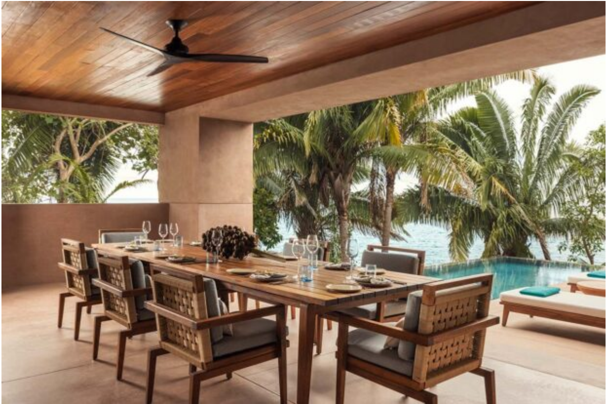
Villa Pacifico, courtesy One&Only Mandarin

The team at One&Only Mandarin is committed to making sure all guests' stays are memorable. But they provide extra care to Grand Villa Guests. Upon arrival, expect welcome canapes, fresh flowers and fruit and a bottle of Champagne. Grand Villa stays also include an unpacking and packing service and garment pressing. And with dedicated butler (available upon request) throughout your visit, you can rest easy knowing you're in good hands.