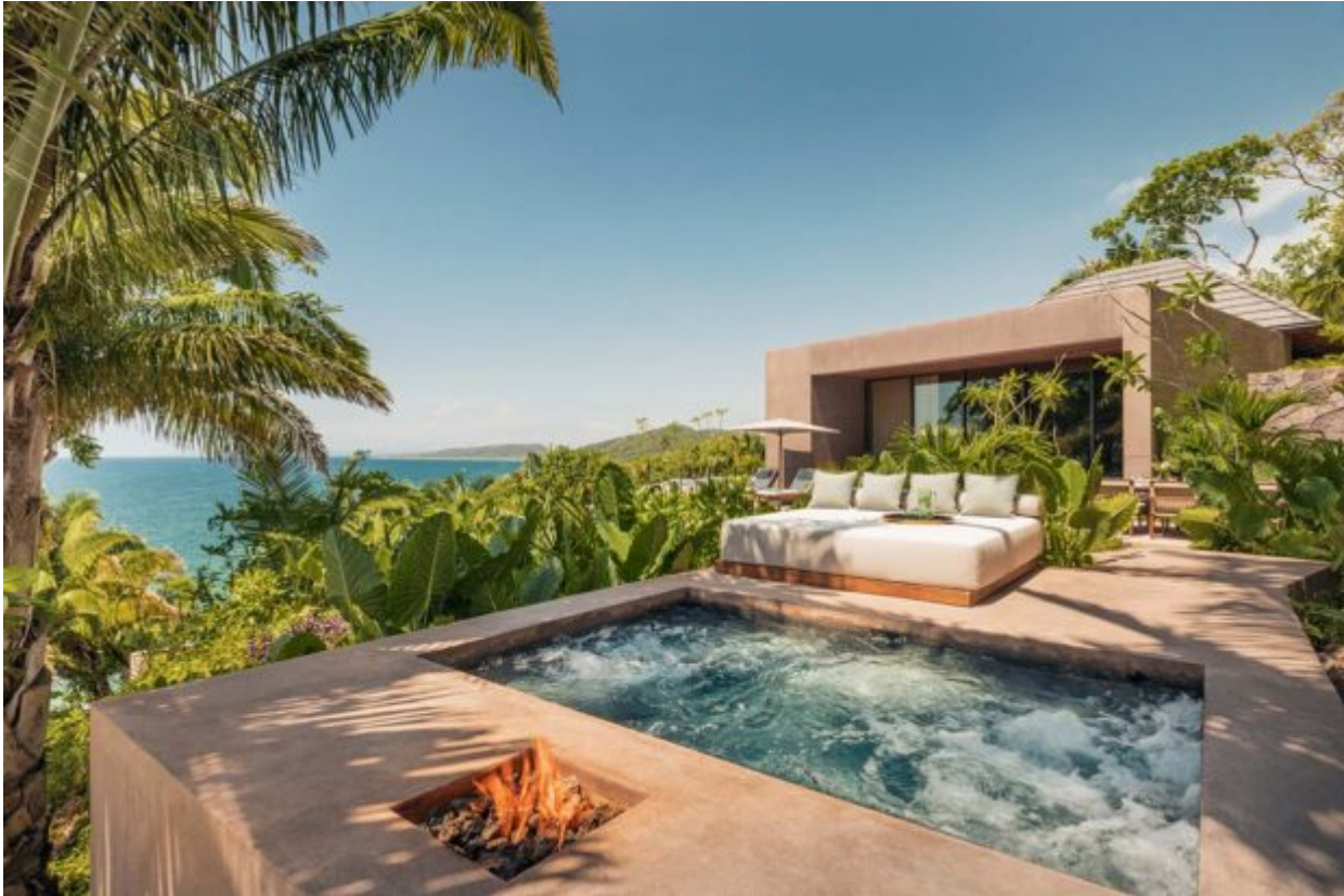
Villa Cumaru

Surrounded by dense greenery, the Grand Villas are One&Only Mandarinina's most secluded accommodations. Villa One and Villa Cumaru are the token three-bedroom and one-bedroom villas respectively, while Villas Banderas, Jaguar, Pacífico and Tortuga are all two-bedroom. These multi-bedroom units are best for families and groups of friends looking to spread out and enjoy one another's company, be it on the expansive outdoor terraces with private pools or in the elegant living areas. Along with the private pools at each Grand Villa, Villa One, Pacífico, Jaguar and Cumaru also have outdoor hot tubs. Villas One, Pacífico and Jaguar each have a barbecue grill on their dining terrace, which make for a great evening dining alfresco, and Villas One and Pacífico both have cinema rooms, perfect for relaxing movie nights after a long day under the sun.