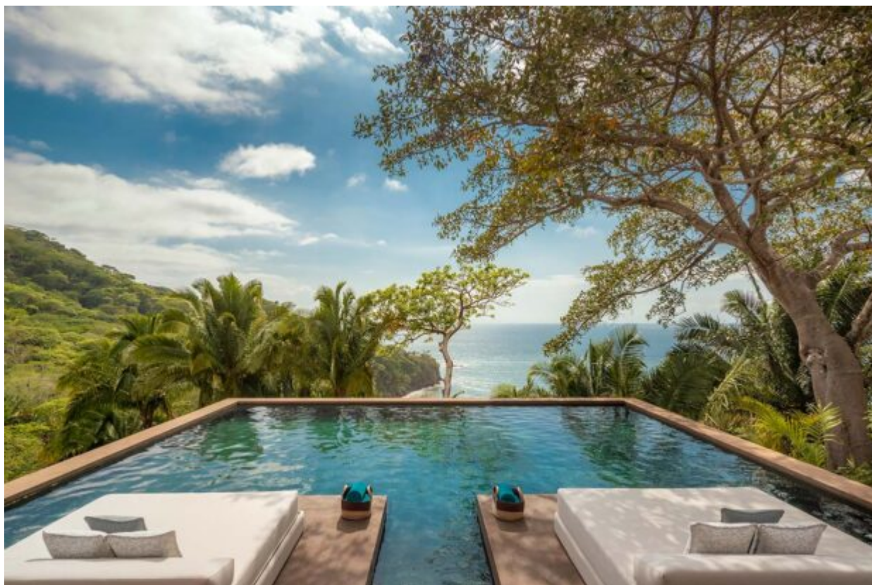
Villa One

Set amid the verdant protected coastal rainforests of Mexico, all of One&Only Mandarin's Grand Villas are clustered on a bluff towards the western edge of the resort. Away from the treehouse accommodations and from most of the other villa suites, these villas allow guests to luxuriate in the peace of nature. They're also conveniently close to Carao, the resort's signature restaurant from Enrique Olvera, with a terrace that's home to the most impressive pool on property (and one of our favorite hotel pools in the world ). Meanwhile, the three-bedroom Villa One has a prime location in the center of the resort with sweeping ocean views and proximity to all restaurant's and the beach.