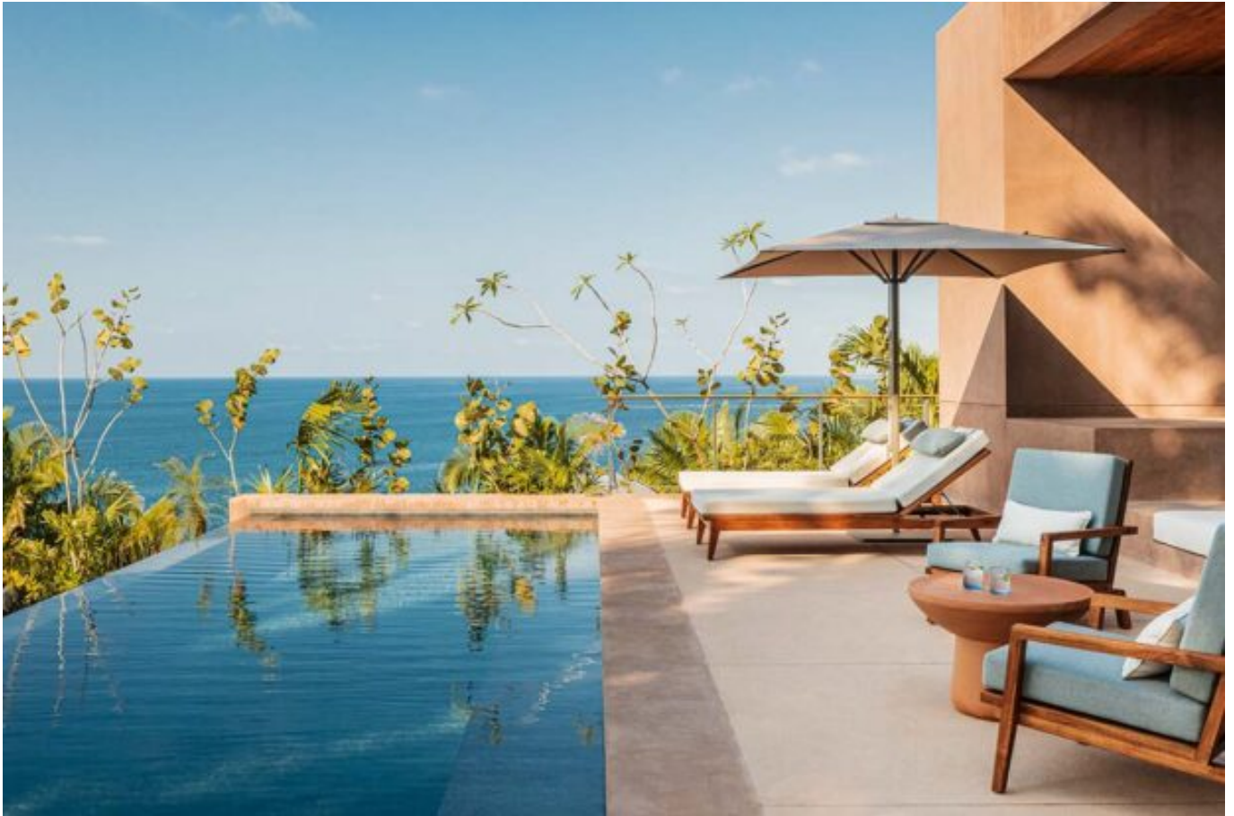
Villa Cumaru

After opening in November of 2020, One&Only Mandarin became a near-instant hit in the Indagare community. Our members headed to the jungle-meets-beach resort on Mexico's Riviera Nayarit for a much-needed getaway, earning it a spot on our list of Most Booked Beach Resorts that year . Many of our members have opted for the treehouse suites, suspended over the forest, with plunge pools amidst the tree canopy. But for even more of an escape, others have checked in to one of five Grand Villas: Villa Cumaru, Villa Tortuga, Villa Jaguar, Villa Pacífico and Villa One. Privacy comes first at these luxe hideouts, where light earth tones, subdued décor and an indoor-outdoor layout allow the lush surroundings to take center stage. Read on for a look into the Grand Villas and what makes them an ideal choice for your next Mexican escape.