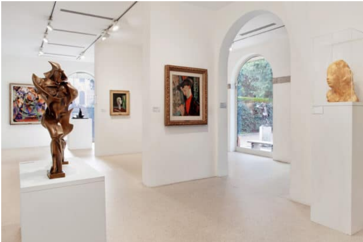
The Peggy Guggenheim Museum in Venice

1948: The Biennale of Peggy Guggenheim 2018 marks the 70th Anniversary of the exhibition of Peggy Guggenheim's collection in the Greek Pavilion at the 24th Venice Biennale—a landmark event in the European art world. Now, the Guggenheim Museum is presenting an homage to the original pavilion, along with works from Peggy's private collection and the Guggenheim Museum in New York, among others. (Through November 25; The Peggy Guggenheim Collection) Tintoretto 1519-1594 Seventy autograph paintings and drawings are displayed with the famous cycles Tintoretto painted for the Doge's palace (now arranged in their original position) in an exhibition celebrating the 500th anniversary of the birth of the 16th-century Venetian painter. (Through January 6; Palazzo Ducale)