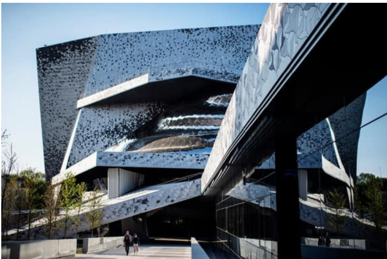
The Philharmonie de Paris, courtesy William Beaucardet