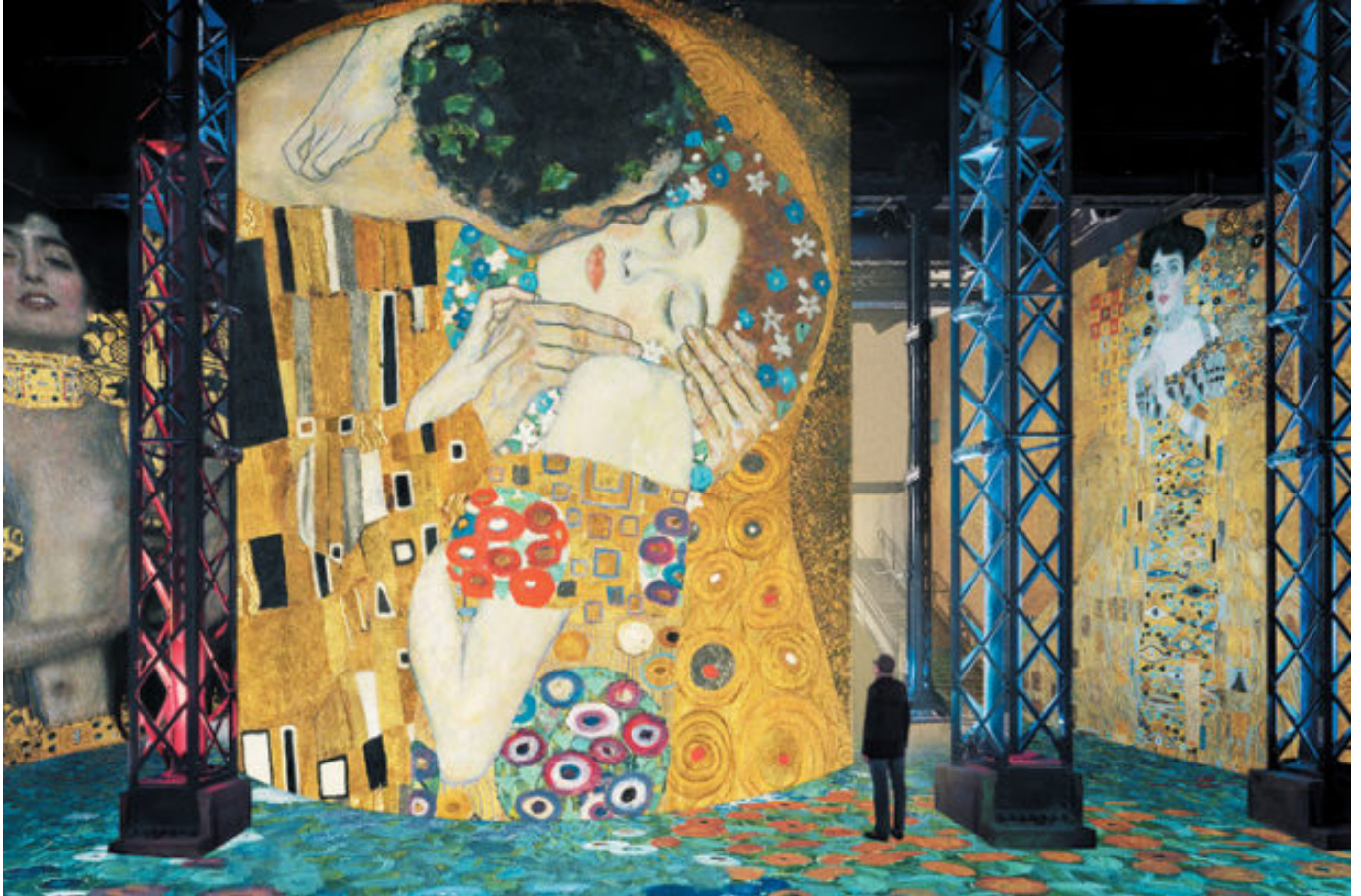
Gustav Klimt's "The Kiss" at the Atelier des Lumières in Paris. Copyright Culturespaces, courtesy E. Spiller.

With the fall season well underway, at Indagare we've been tracking the latest in art, theater, fashion, film and design around the world. What's on our radar right now? Top art exhibitions and the best new plays and musicals in New York , London , Paris , Los Angeles , Venice and beyond. From Broadway to the Grand Palais, this is Indagare's guide to the must-see shows and openings this fall. Contact Indagare to book a culture-filled fall trip to New York, London, Paris or other cities, with tickets to the best new shows and more. Indagare can also arrange expert-guided touring with special access and make reservations at the right hotels and restaurants for you.