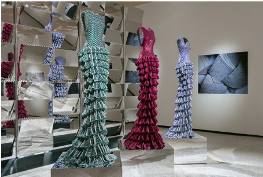
The Alaïa Exhibition at the Design Museum, London.

Fashioned from Nature This thought-provoking display of designer clothing, fabrics and other historical artifacts deconstructs the uncomfortable and fruitful relationship between the natural world and fashion over the past century, with displays of pieces from such designers as Stella McCartney, Christian Louboutin, Calvin Klein and more. (Through January 27; Victoria and Albert Museum, Gallery 40 ) Frida Kahlo: Making Her Self Up This exhibition showcases an impressive collection of Kahlo’s personal belongings that have never been seen outside of Mexico. (Through November 4;