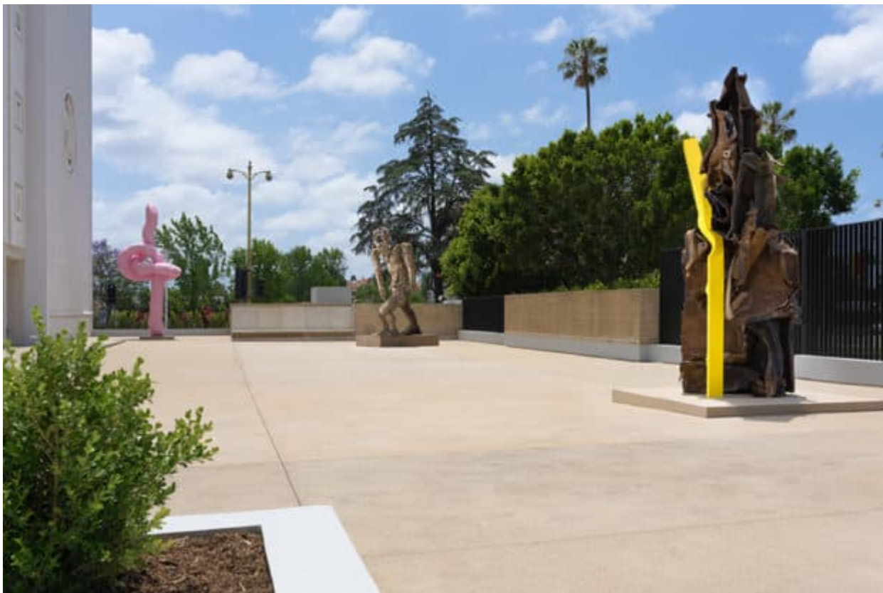
L.A.'s Marciano Art Foundation courtyard

King Tut: Treasures of the Golden Pharaoh In celebration of the 100th anniversary of the discovery of King Tut's Tomb, the California Science Center is displaying the most complete collection of King Tut artifacts ever shown outside of Egypt. ( Through January 6; California Science Center ) Icons of Style: A Century of Fashion Photography, 1911-2011 Through more than 160 photographs—displayed alongside costumes, magazine covers, videos and advertisements—this exhibition deconstructs our society's notions of style and beauty as shaped by the fashion photography industry,