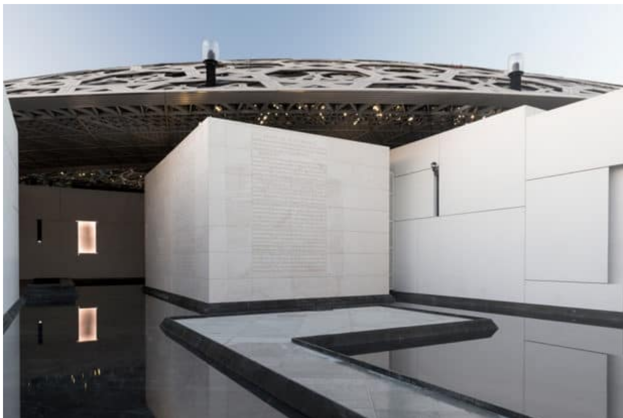
The Louvre Abu Dhabi. Courtesy Jenny Holzer, Photography by Marc Domage