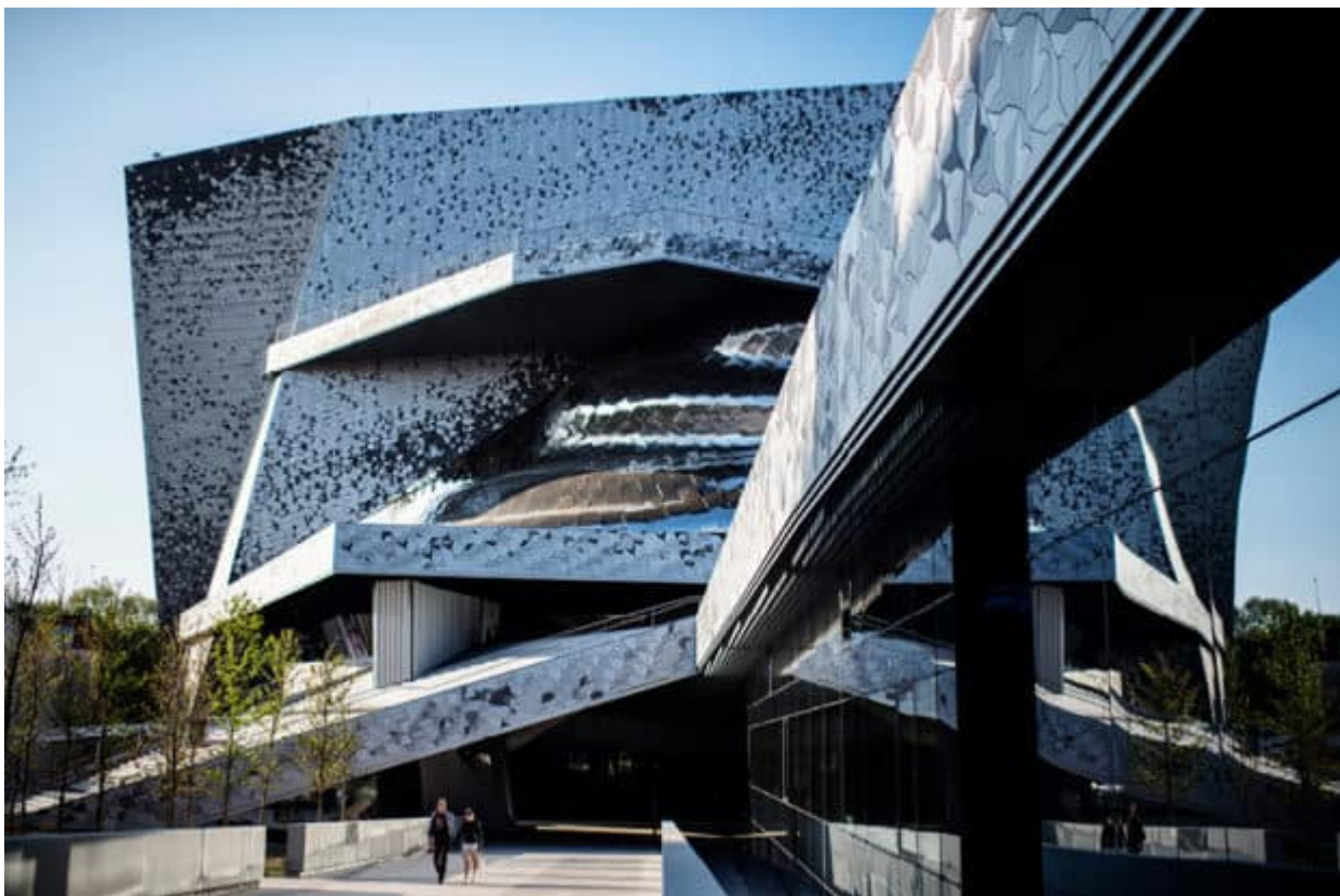
The Philharmonie de Paris

Cyrano de Bergerac Performed in French, with English subtitles, this French play