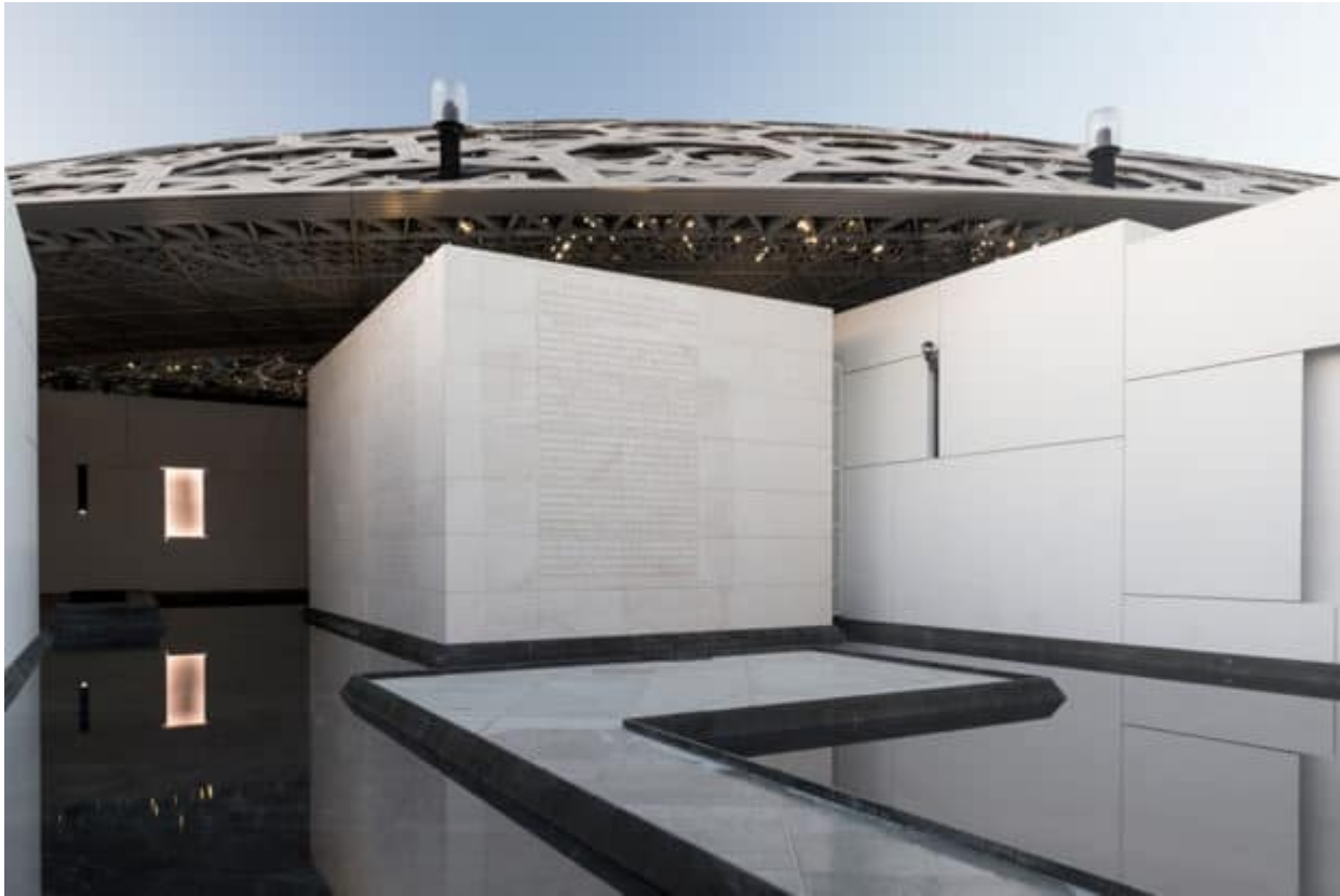
The Louvre Abu Dhabi. Courtesy Jenny Holzer, Photography by Marc Domage