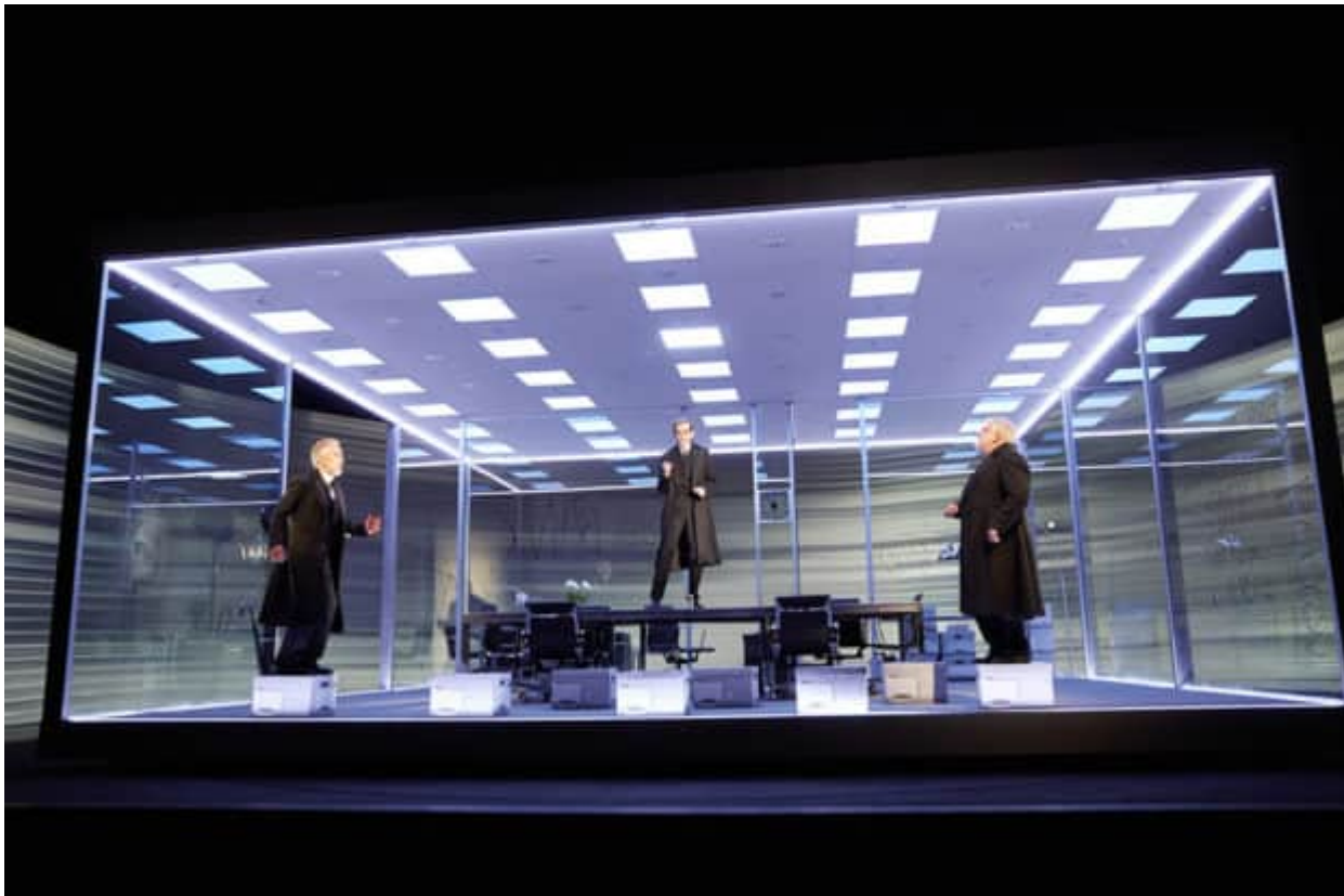
The Lehman Trilogy at the National Theatre, London.

The Lehman Trilogy The most-coveted ticket in town, The Lehman Trilogy is a three-actor play, directed by Sam Mendes, that recalls the lives of well-known bankers Henry, Emanuel and Mayer Lehman and their firm's collapse into bankruptcy. Although the show is now sold out, a limited number of additional tickets will be available for purchase through rush and day-of sales. ( Through October 20; National Theatre ) King Lear Ian McKellen has already garnered high praise for his portrayal of Shakespeare's tragic, maddened ruler. ( Through November 3; Duke of York's Theatre ) Tina: The Musical This chronicle of Tina Turner's life and career debuted last spring to great acclaim and continues to draw crowds. ( Through February 2019; Aldwych Theatre ) Company Starring Patti LuPone, Company is a gender-reversed production of Stephen