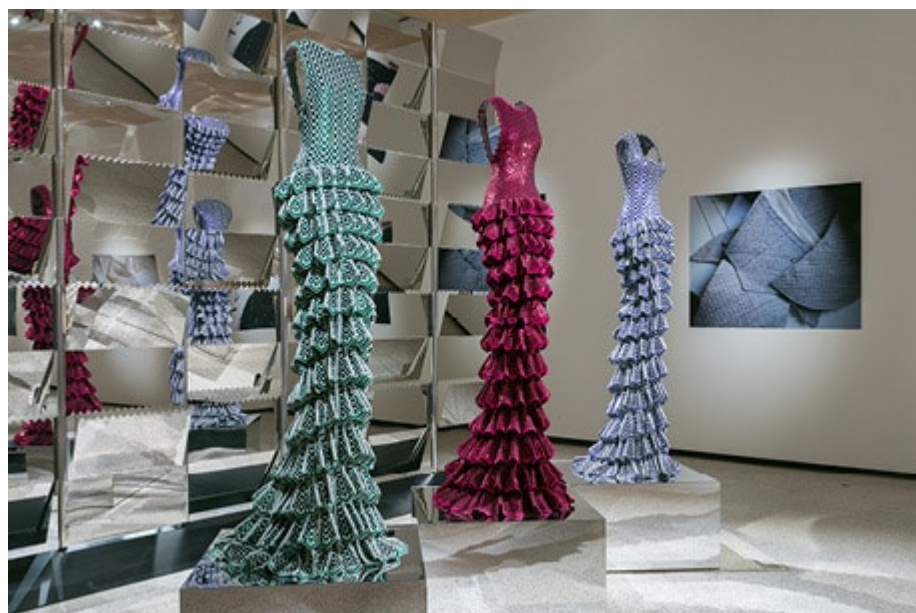
The Alaïa Exhibition at the Design Museum, London.

Fashioned from Nature This thought-provoking display of designer clothing, fabrics and other historical artifacts deconstructs the uncomfortable and fruitful relationship between the natural world and fashion over the past century, with displays of pieces from such designers as Stella McCartney, Christian Louboutin, Calvin Klein and more. ( Through January 27; Victoria and Albert Museum, Gallery 40 ) Frida Kahlo: Making Her Self Up This exhibition showcases an impressive collection of Kahlo's personal belongings that have never been seen outside of Mexico. ( Through November 4; Victoria and Albert Museum, Gallery 38 ) Azzedine Alaïa: The Couturier Co-curated by the legendary designer before his death in 2017, this exhibition is the first-ever retrospective of Alaïa's work and tells stories from his life and career alongside designs