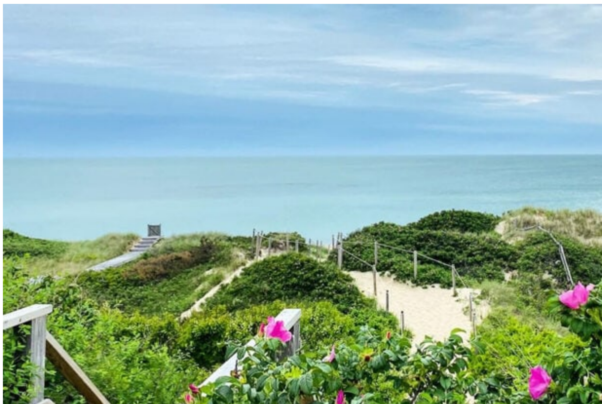
The path to one of Nantucket's beaches.

Unlike Martha's Vineyard , where many of the most beautiful beaches are private, Nantucket has miles of sandy public beaches. Families love Jetties and Children's beaches, which have playgrounds and a gentle surf, while Surfside, with its wild waves and wide stretches of sand, is more of a scene, especially during the high season. Two additional favorites are Dionis Beach, which has calm waters and dunes, and the stretch of Cisco Beach known as Ladies Beach, on the southwestern shore.