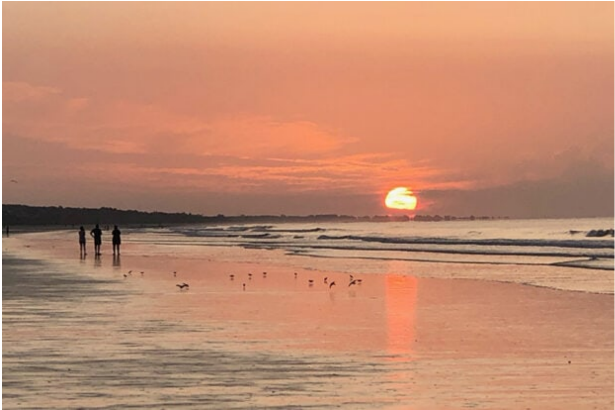
Sunset on Kiawah Island.

Located less than an hour's drive from the charming city of Charleston , South Carolina, this barrier island on the Atlantic coast features ten miles of beachfront, including the public Beachwalker County Park, a well-kept and peaceful expanse of sand, nestled between a river and the ocean.