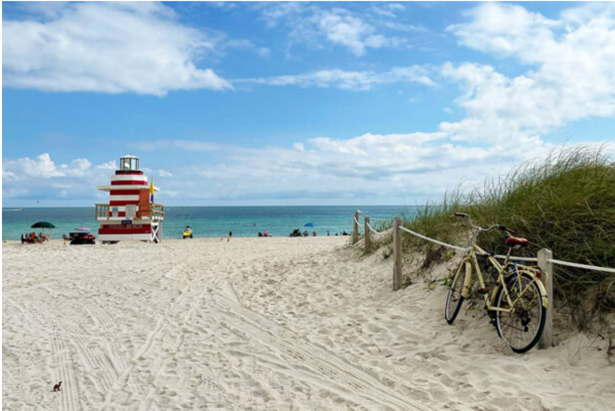
Miami Beach.

The seven-square-mile Miami Beach in Florida is one of America's most famous oceanfront destinations—and with good reason. With soft white sand and hip hotels at the ocean's edge (including the sumptuous Four Seasons Surf Club and the trendy Miami Beach EDITION ), there's a slice of sand for every type of traveler, from vacationing families to low-key couples to late-night revelers.