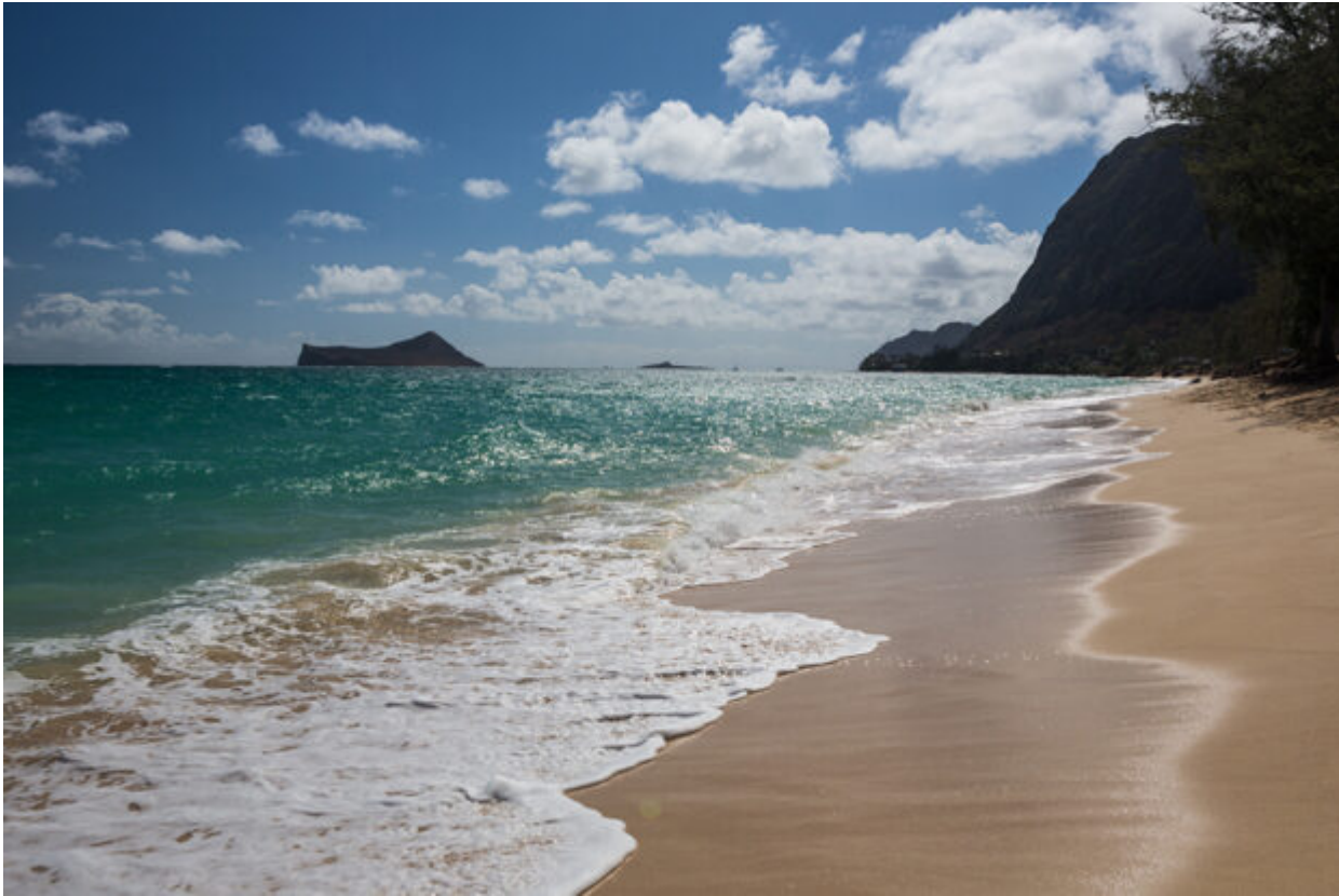
Waimanalo Beach.

Centuries ago, the island of Oahu served as the private playground of Hawaiian royalty, and the beach at Waimanalo Bay still feels reminiscent of that era. Less touristed than many of Hawaii 's top beaches, this picture-perfect pocket of soft white sand and turquoise waves allows travelers to escape the buzz of Honolulu and retreat to a quiet corner of southeastern Oahu.