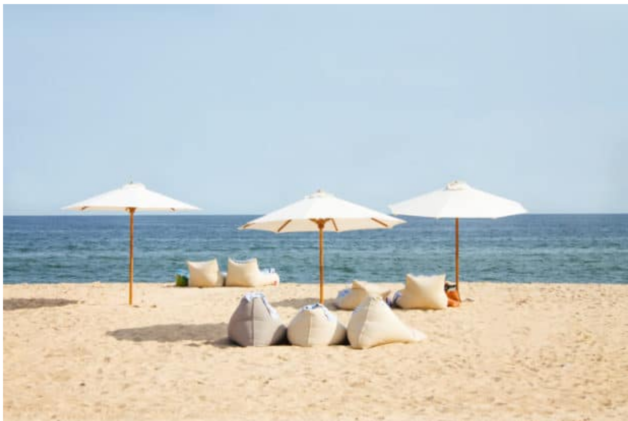
Montauk, New York.

At the easternmost tip of Long Island, Montauk's beaches feel less developed compared to the rest of the Hamptons , promising a rustic and relaxed escape against the backdrop of the village's 70-foot bluffs. From Kirk Park Beach, nearest to town, all the way to Ditch Plains, a popular surfing spot thanks to its unusually long break, Montauk offers a laidback vibe and plenty of seaside eateries to complement your beach time.